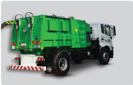
Truck Mounted Vacuum Loader