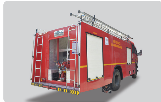
Fire Fighting Vehicle